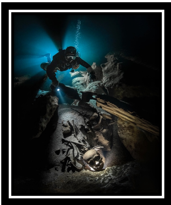
A Mayan skull in a Yucatan Cenote.