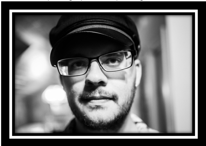
He says, "Photography is my medium; light is my paintbrush."

This West Coast native calls Southern California and Western Washington home, where he calls himself "a full-time u/w photographer and photo gearhead."