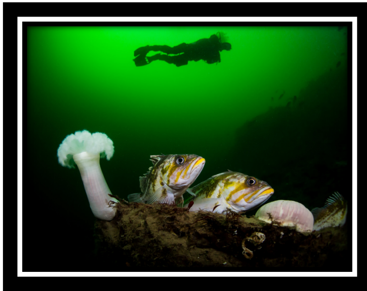
Scuba diver and rockfish in the Hood Canal, WA.

Bluewater Photo's Nirupam Nigam presents the best method for approaching, finding and photographing these charismatic critters.