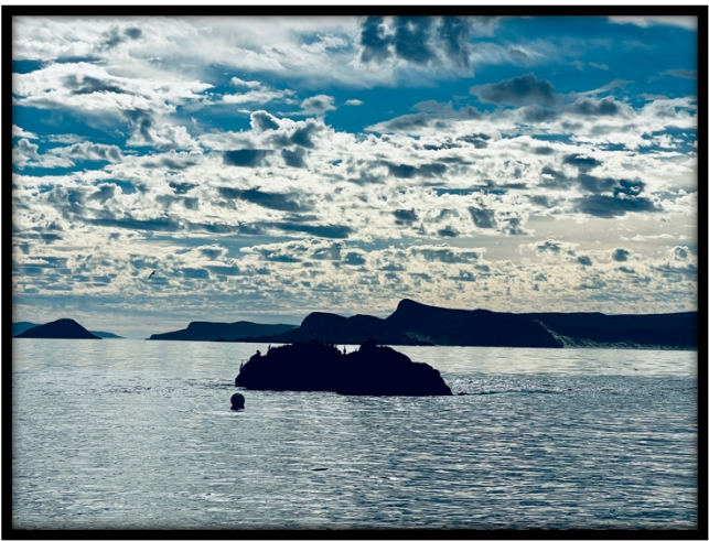
Wilson Rock, Channel Islands