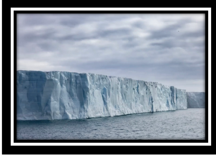
The polar ice cap.