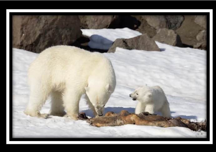
Only several thousand polar bears are still alive in Norway. Some are enjoying "walrus jerky". It's "Finger Lickin' Good".

Along the way, they saw reindeer (called caribou in North America) along a glacier river who enjoyed eating Arctic Cottongrass, harbor seals which are a favorite of polar bears, Atlantic puffins, other sea birds, and arctic foxes.