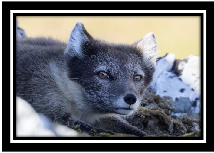
An Arctic fox. Who's a good boy?