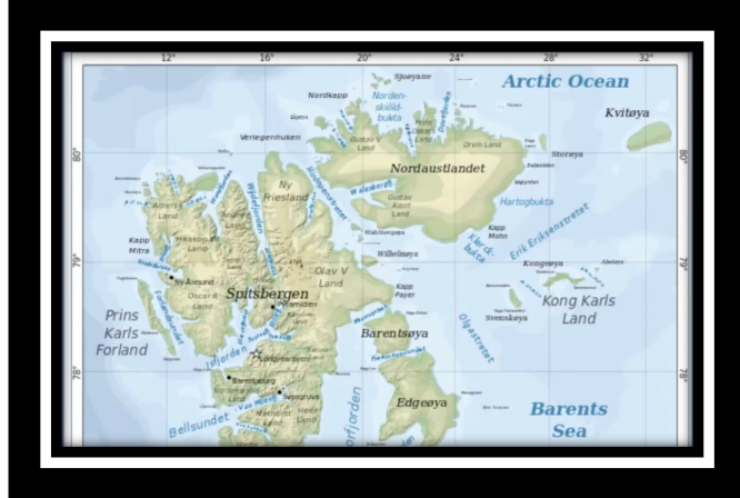
Jodi and her shipmates circumnavigated Spitsbergen on a 10-day voyage aboard the MV Polaris 1.

Jodi showcased her amazing photography of Svalbard, a Norwegian archipelago located halfway between the North Pole and Norway, south of the Arctic Ocean.