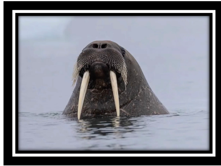
"I am the walrus, ku-ku-ka-chu!"