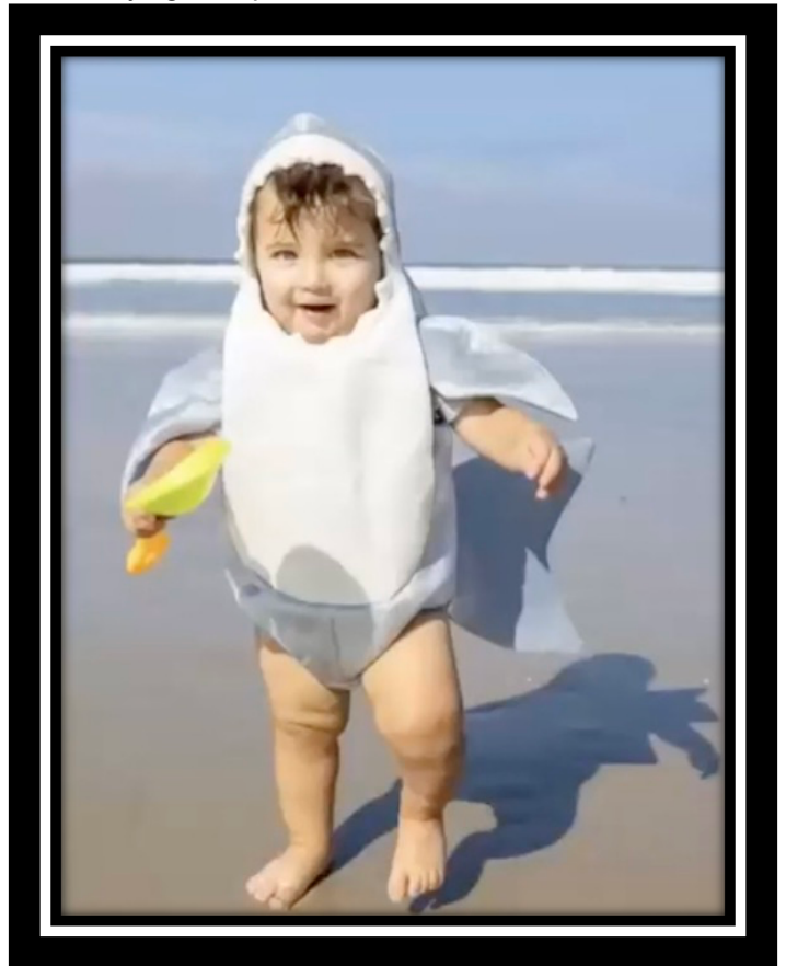
Jami's son is a perfect choice for comedic content.

“Changing up your content” includes showing her content behind the scenes, comedy, fun trip shenanigans, and “in the moment” vs. “the photo” with her GoPro camera to see what she was trying to capture.