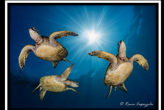
“Triple Turtle Sunburst” on Maui.

Her essential equipment includes a large dome port (230 mm), wide-angle lens, dual strobes to light and freeze the action, and mask defogger for the camera lens. Among her favorite places to shoot are Maui. She prefers low light and likes to get close to her subjects if possible.