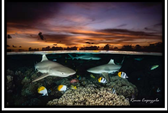
Sharks are a favorite image but they're very shy.

A large audience was treated to a fantastic presentation in November by one of the world's best photographers.