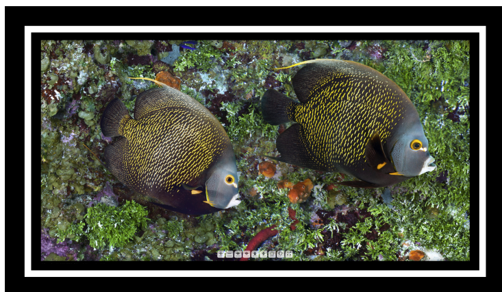
Great Wall West Mural, revisited in 2010.