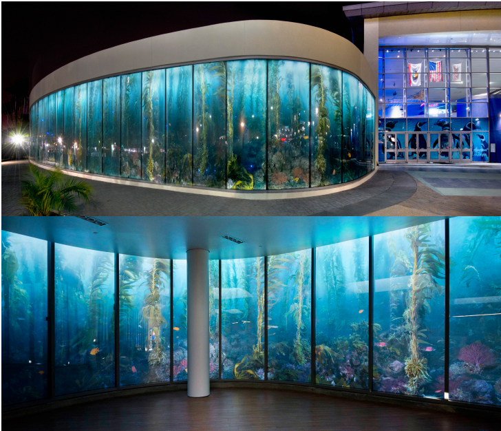
His 12' x 125' Mural at Aquarium of The Pacific in Long Beach.

Explore The High-Resolution Images of Great Wall West: Explore Great Wall West 1999 Explore Great Wall West 2010 Great Wall West Fluorescence