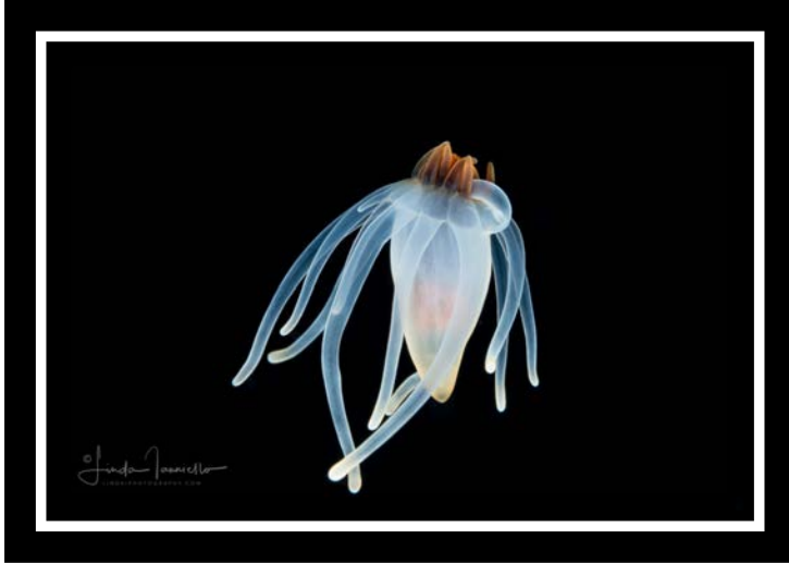
Tube Anemone Pelagic Larva

Linda will be talking about the mechanics of a black water dive and the variety of creatures found on these dives; also a few photography tips and a bit about the “citizen science” value of these dives.