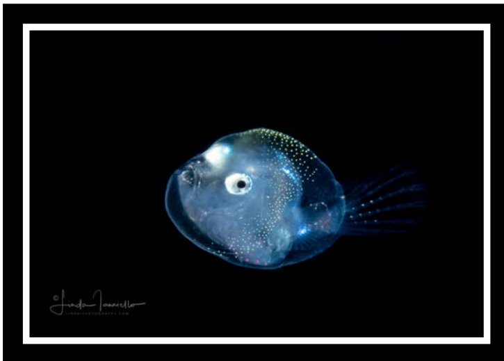
Sea Devil Anglerfish Larva

For a full compilation of the creatures she has found and photographed, check out her website's galleries of black water trips and other excursions, from Florida the Philippines, Grand Cayman, and Indonesia: https://lindaiphotography.com/galleries/