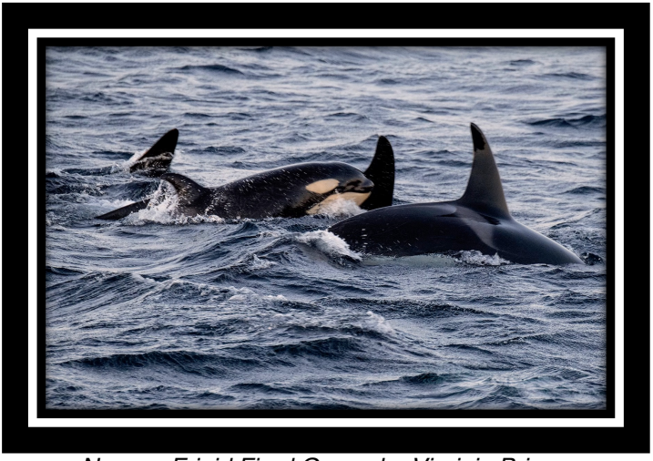
Norway Frigid Fjord Orcas

She concluded, "Seeing orcas in person and in the water for the first time was incredibly spiritual."