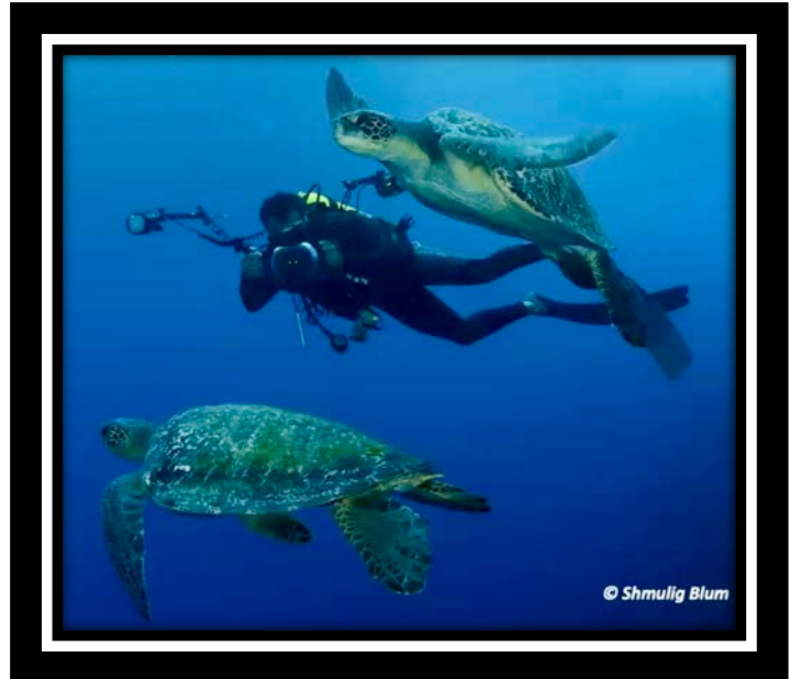
Leatherback turtles are in abundance, but declining.