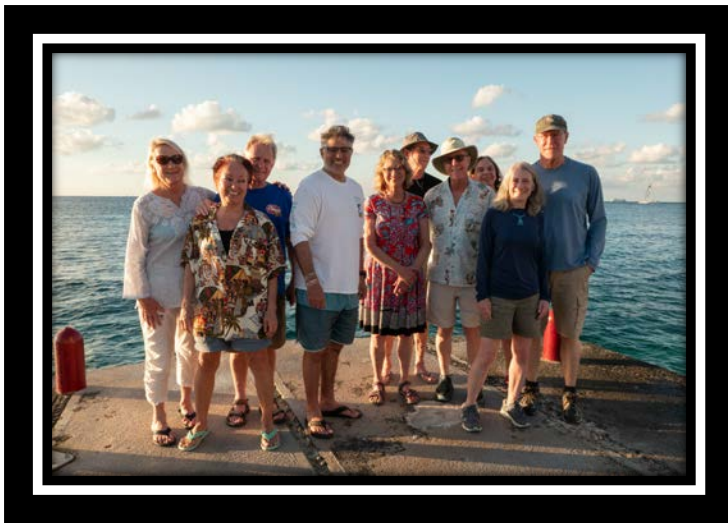
The ten Marin Scuba Club divers who escaped the Bay Area’s “Rainmageddon” for Cozumel.

Some highlights: diving San Francisco Wall, we had 200 feet of visibility with beautiful healthy corals. It was eagle ray season and we were treated to many and the largest all have ever seen, close-up and also feeding.