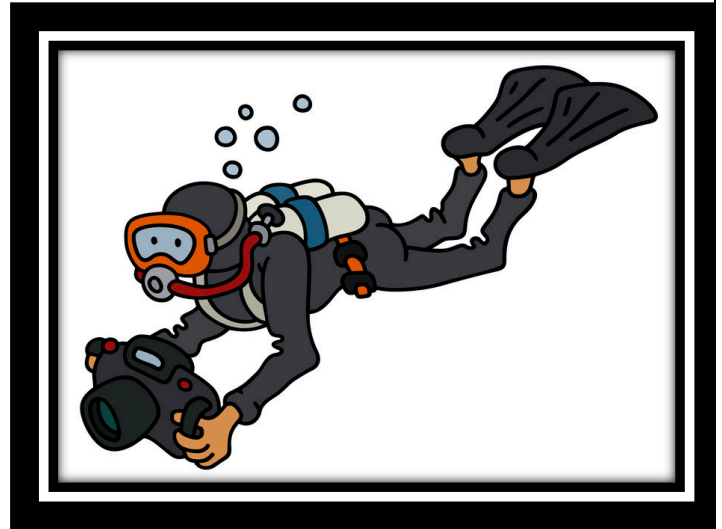
MSC membership is a great value.

Marin Scuba Club will reduce 2021 membership fees for all who have not renewed yet during 2020. The rebate will be based on the number of months that we are closed for meetings: with three closed meetings to date (March, April and May), that is a 27.5% rebate in 2021.