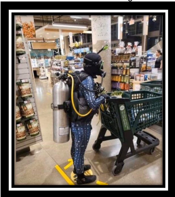
Are you wearing PPE while shopping?