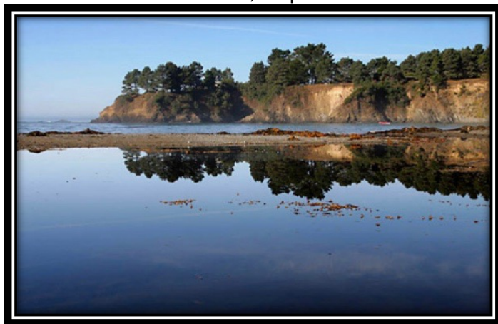
The Mendocino Coast beckons. Join MSC for the Fall D&D!