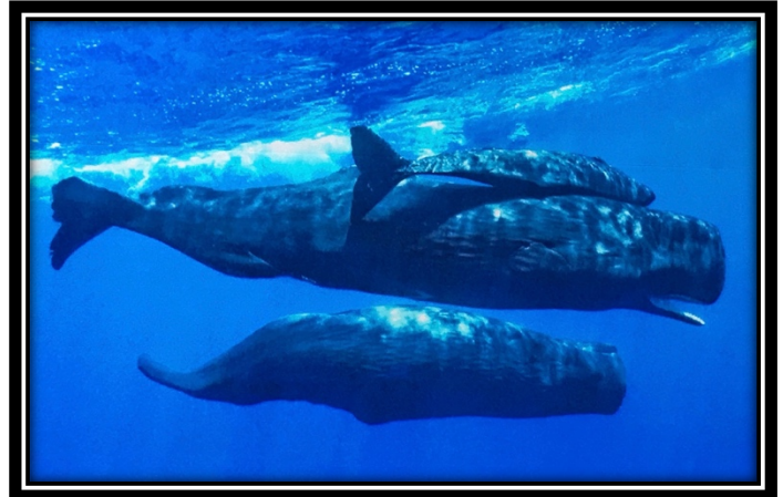
Dominica Sperm Whales: Warning: They have teeth, not baleen!