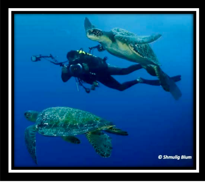
Leatherback turtles are in abundance, but declining.