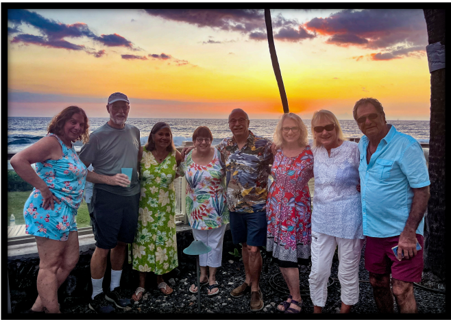
The MSC Hawaiian Divers enjoying a poolside BBQ.

"Five members enjoyed blackwater diving. Barb's highlight was a close encounter with an aggressive oceanic white tip shark. All needed to abandon the dive. We moved the boat and resumed our blackwater dive with amazing sea creature diversity. Eleven members dove up north with Blue Wilderness Divers. We loved the turtle cleaning station dive, clear water, and turtles surrounded by yellow tangs and more. In addition, we had great Happy Hours and dinners together on four evenings. We'll have a video loop of our fantastic diving and dining at the Holiday Party."