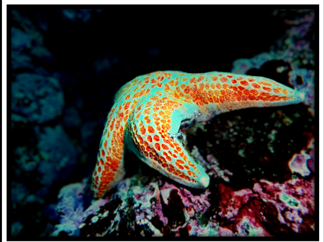
from Blue Friday 2021

This is a perfect way to work off your big Thanksgiving meal and do something totally different the day after, instead of sharpening your elbows and fighting the crowds at the mall to do your holiday shopping when you'll probably do more of it in mid- to late-December.