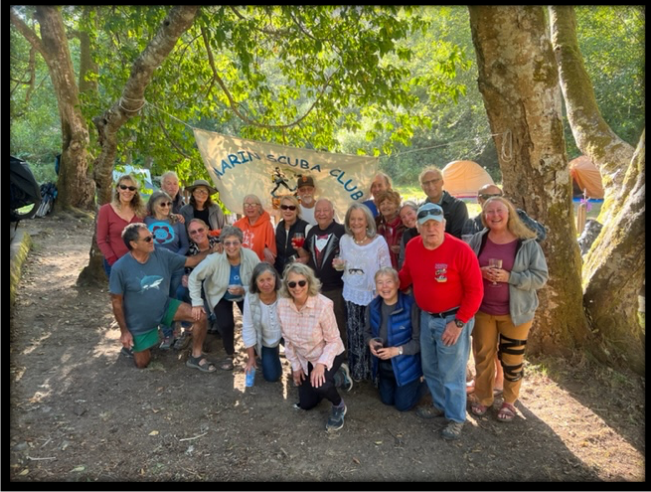
A gaggle of happy MSC campers.