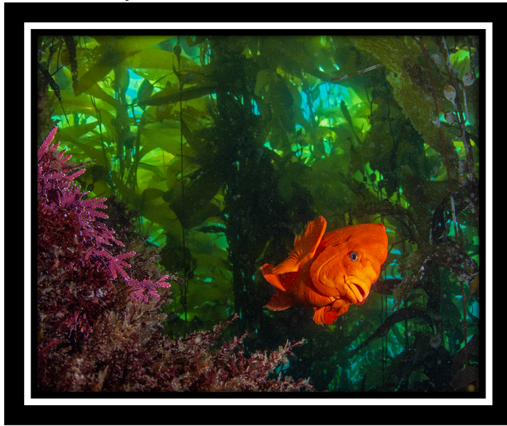
Virginia captured this Channel Islands' Garibaldi.