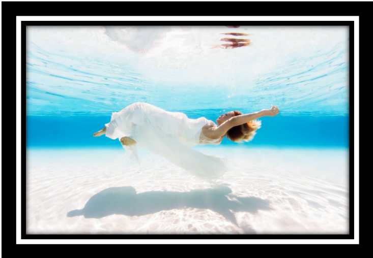
A breast cancer survivor

https://www.kqed.org/arts/13908113/rightnowish-erena-shimoda-underwater-photography