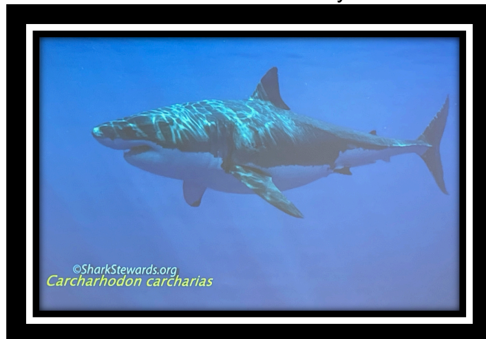
The GWS gets all the publicity as apex predator.