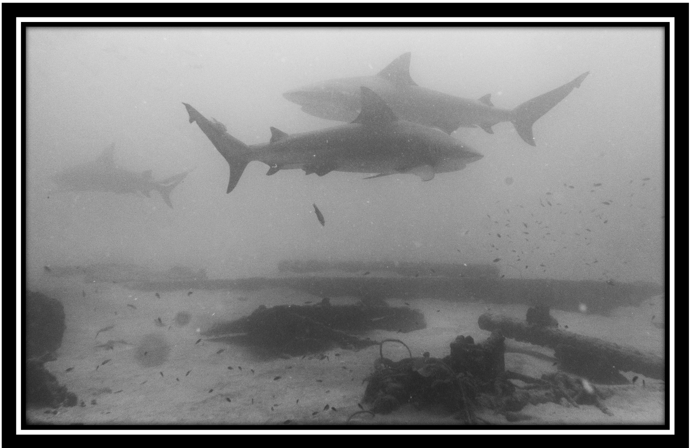
Bull Sharks were plentiful in Cabo Pulmo.

“We gathered for three Happy Hours pre-dinner (see next page photo). It was a super fun trip and the first club trip since COVID-19. Unfortunately, in La Paz, the whale shark permits were not yet released, as there are more restrictions around the ratio of boats to sharks. In lieu of a whale shark snorkel, 12 members enjoyed a beautiful day of snorkeling and lunch on the beach. A good time had by all.”