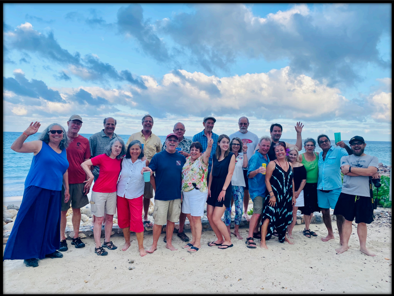
Mucho, Mucho Happy Hour.