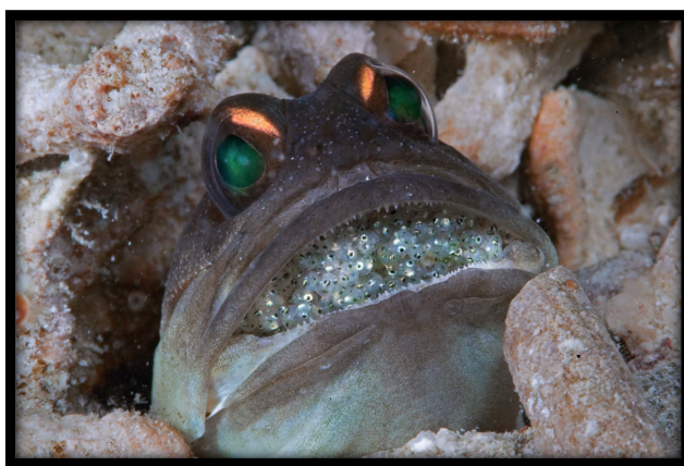
Marty travels with “4 strobes, 3 camera bodies, 2 housings, and 1 pair of underwear”.

Marty presented exactly the type of master class on fish and their behaviors that we all expected from a world-renowned photographer with 15,000 dives logged and a 50-year legacy.