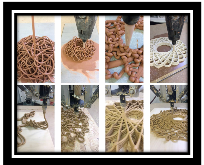
Terra cotta can be reformed into all kinds of shapes and sizes.

"Different fish are attracted to different colors," he adds. "And each piece of coral is custom-made, burnt in a kiln at 1,600° F., and completely unique."