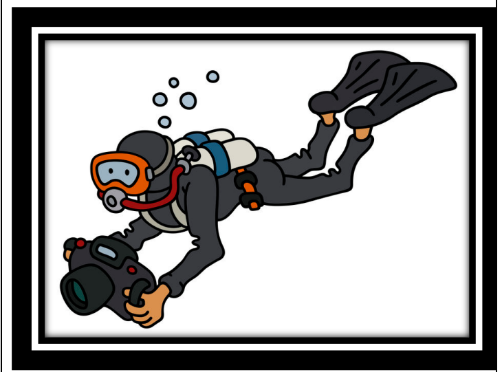
MSC membership is a great value.

Marin Scuba Club will reduce 2021 membership fees for all who have not renewed yet during 2020. The rebate will be based on the number of months that we are closed for meetings: with three closed meetings to date (March, April and May), that is a 27.5% rebate in 2021.