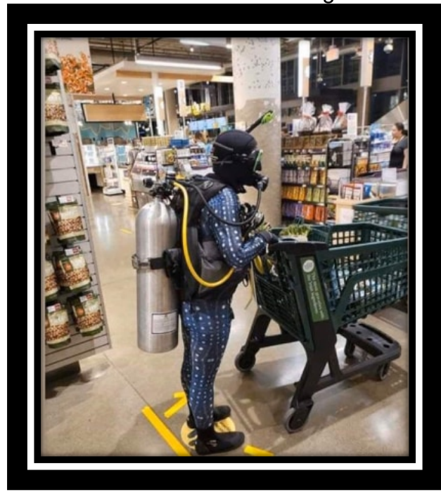
Are you wearing PPE while shopping?