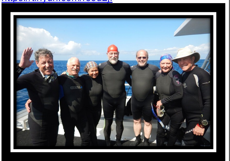
What's not to enjoy with 80° water & 100-ft vis?

While on a dive trip with 9 other senior members of MSC to <u>Little Cayman Beach Resort</u>, we overcame a few issues and thoroughly enjoyed our experiences. Collectively, we completed 170 dives despite wearing prescription masks, having a few equipment problems, and dealing with other underwater senior moments. Read more: <a href="https://tinyurl.com/rs5u2if">https://tinyurl.com/rs5u2if</a>