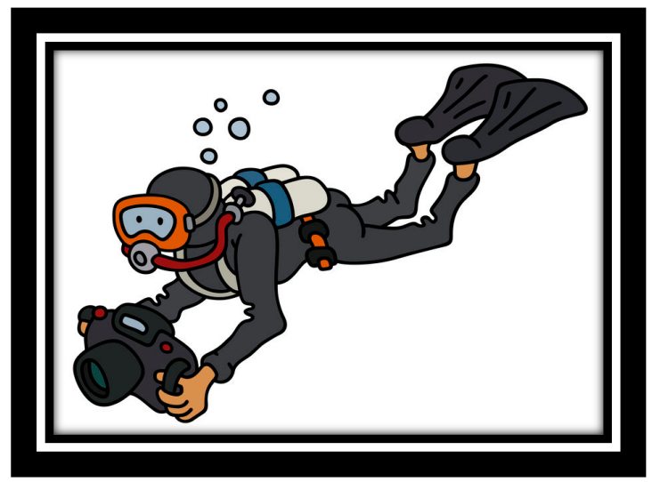
MSC membership is a great value.

Effective 01/01/20, our annual fee for an individual membership went up 20% for both individual and couples living at the same residence.