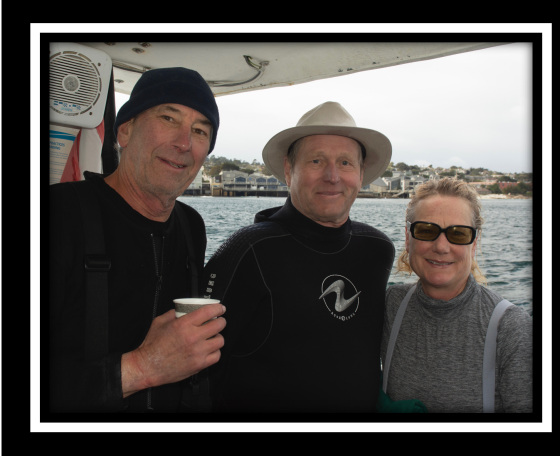
Cold but smiling after a dip in Monterey Bay.

These were early days of coronavirus. Everything was normal on Friday, March 6<sup>th</sup>. But by Saturday March 7th, no masks could be cleaned in a shared water bucket. Diving is now closed.