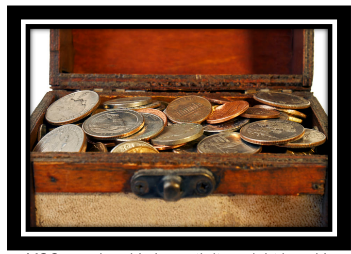
MSC membership is worth its weight in gold.

As you may have read in previous months, MSC is raising our annual dues for the first time in at least 10 years. This will help cover the rising costs of hosting monthly meetings, events, and parties.