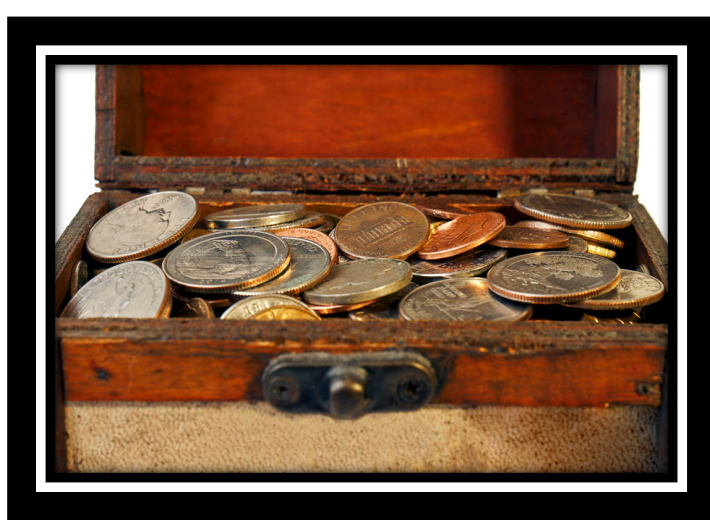
MSC membership is worth its weight in gold.

For the first time in at least 10 years, MSC is raising our annual dues to help cover rising costs of hosting monthly meetings, events, and parties.