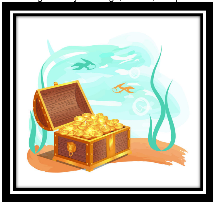
MSC membership has its rewards.

For the first time in at least 10 years, MSC is raising our annual dues to help cover rising costs of hosting monthly meetings, events, and parties.