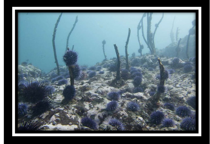
Millions of sea urchins have destroyed our kelp.

Five members of the Marin Scuba Club plan to participate in the Urchin Harvest Event coming up on Saturday, November 2nd. Kayakers, shore helpers, and divers are welcome to attend.