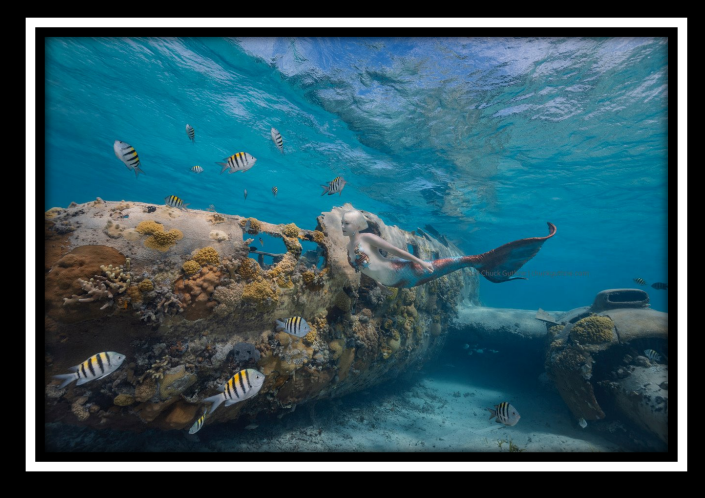
A mermaid in her element: "Under The Sea".

For November, we will be treated to a presentation by a real, live mermaid. She doesn't have an operatic singing voice. Her best friend is not a crab named Sebastian. She won't marry a prince.