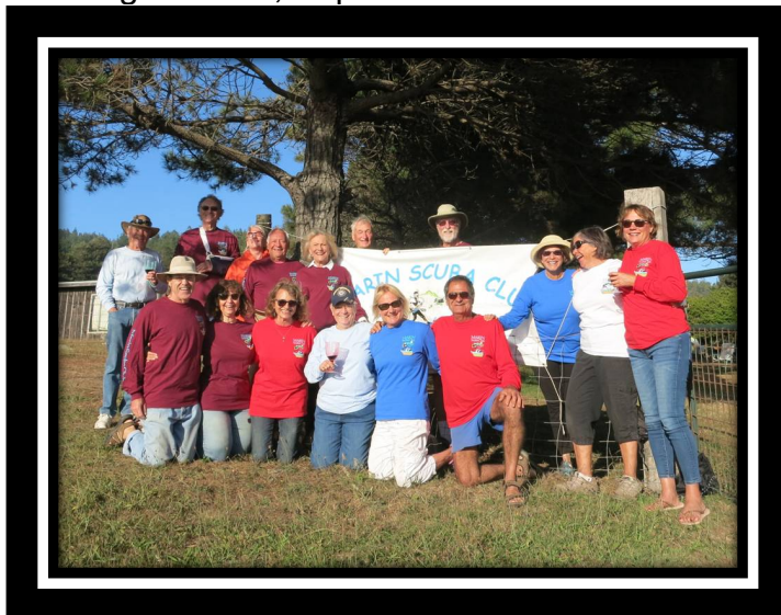
They didn't dive, but they sure did dine!

"Over 20 club members attended our annual Dive & Dine at Ocean Cove and enjoyed perfectly stunning weather," reports Barb Wambach.