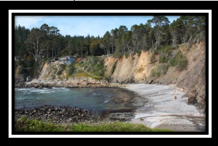
The beautiful Sonoma Coast beckons you.

Our next social event is August 16<sup>th</sup> – 18<sup>th</sup>. Join us at Group Campsite #3 at Ocean Cove, 23150 CA-1 in Jenner for diving, dining, and sharing food. The site can accommodate up to 35 people, including 10 parking spaces, room for RVs and vans, a boat ramp, and hot showers.