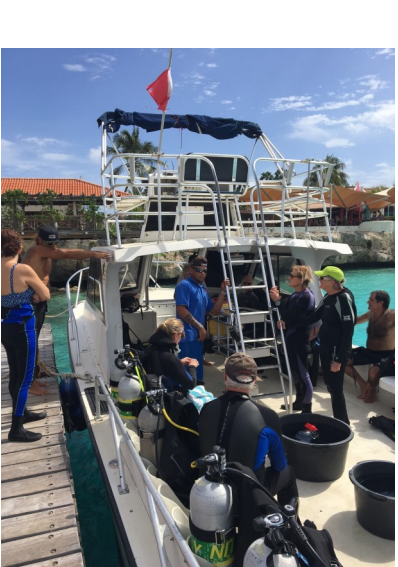
MSC divers aboard their dedicated dive boat, Ocean Freedom.